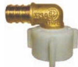
90° ELBOW Pex to FPT Swivel