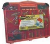
Part No. PEX-KIT-HC