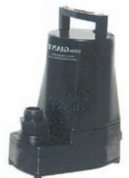
1/6 HP - Part No. MPA16A