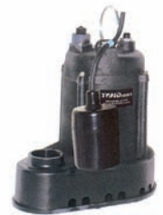
1/3 HP - Part No. SC33T