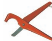
TUBE & PEX PIPE CUTTER