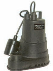
1/3 HP - Part No. SP33T