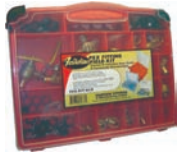
Part No. PEX-KIT-BCR