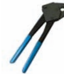
PEX ANGLE CRIMP TOOL