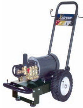
2 HP - Part No. X-1520EW1COMX

Motor .....1 phase 220V (7.5 hp) Pump ..... Comet FWS3530E GPM ..... 3.5 PSI ..... 2700 Amps ..... .32 Weight ..... .219 lbs. • 50' Steel wire braided hose • Industrial 5000 PSI spray gun • Powder coated steel frame • Low pressure chemical injector • 0°, 15° & 40° Quick connect nozzles & soap nozzle * Does not include cord, switch or plug.*