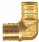
90° ELBOW Pex to Pex