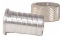
STEEL SWIVEL ADAPTER PLATED (FPT x HB)