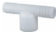
NYLON TEE HB x HB x FPT