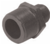
REDUCING NIPPLE MPT