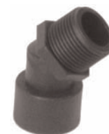
POLYPROPYLENE 45° STREET ELBOW