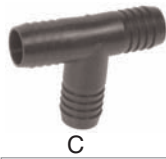
POLYPROPYLENE HOSE BARB TEE