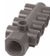
POLY MANIFOLD 8 - 1/2" Ports 3/4" Inlet 1/4" Gauge Port