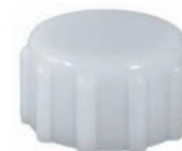
NYLON FPT CAPS