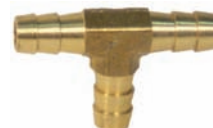
BRASS HOSE BARB TEE