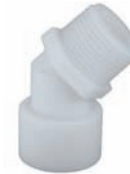
NYLON 45° STREET ELBOW FPT x MPT