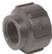
REDUCING COUPLING FPT