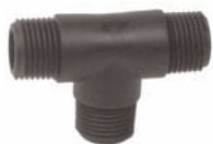
POLYPROPYLENE TEE MPT