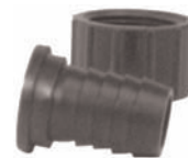
POLYPROPYLENE FLAT SEAT SWIVEL CONNECTOR FPT/FGHT x HB