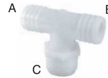
NYLON TEE HB x HB x MPT