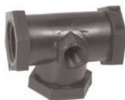
POLYPROPYLENE TEE WITH 1/4" GAUGE PORT