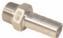
HOSE ADAPTERS • 316 Stainless Steel (MPT x HB)