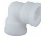
NYLON 90° ELBOW FPT