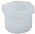
NYLON REDUCING BUSHING