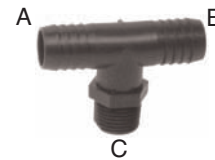
POLYPROPYLENE TEE HB x HB x MPT