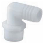
NYLON ELBOW FPT x HB