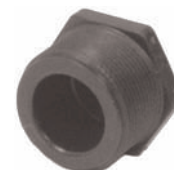
HEX HEAD PIPE PLUG