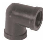
POLYPROPYLENE 90° ELBOW