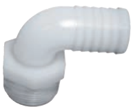
NYLON ELBOW UNF x HB MPT x HB