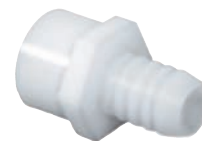
NYLON ADAPTER FPT x HB