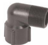
POLYPROPYLENE STREET ELBOW