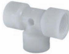
NYLON TEE WITH 1/4" GAUGE PORT