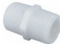
NYLON NIPPLES UNF x UNF MPT x MPT