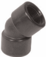
FEMALE 45° PIPE ELBOW