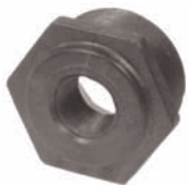
REDUCING BUSHING MPT x FPT