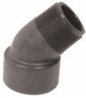
45° STREET ELBOW FPT x MPT