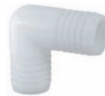
NYLON HOSE BARB ELBOW