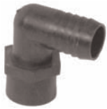
POLYPROPYLENE ELBOW FPT x HB