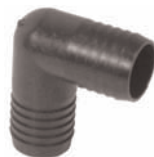
POLYPROPYLENE HOSE BARB ELBOW