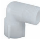
NYLON STREET ELBOW FPT x MPT