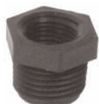
POLYPROPYLENE REDUCING BUSHING