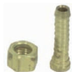
BRASS HOSE BARB SWIVEL 2" Long Hose Barb