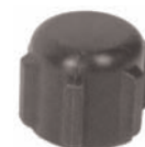
POLYPROPYLENE FPT CAPS