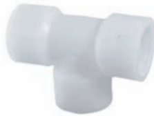
NYLON TEE FPT