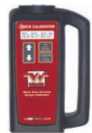
ELECTRONIC CALIBRATION - PAGE 22