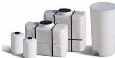
TANKS - PAGE 4