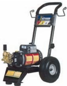
GAS & ELECTRIC PRESSURE WASHERS - PAGES 10 - 11