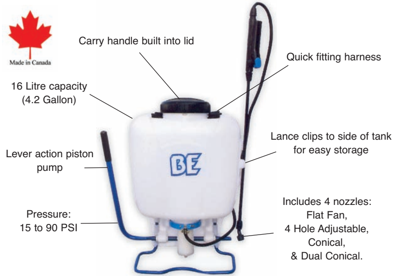
Part No. 7917