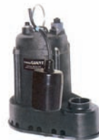
SUMP & SEWER PUMPS - PAGE 9