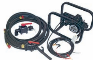
TRANSFER PUMPS - PAGE 200