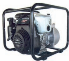
WATER PUMPS - PAGE 8