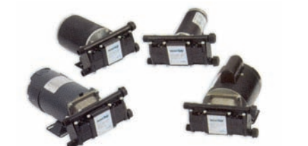
DIAPHRAGM & CENTRIFUGAL PUMPS - PAGE 201