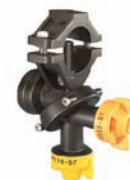
KWIK STOP NOZZLE BODIES - PAGE 71