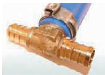
PEX FITTINGS, TUBING & TOOLS - PAGES 14 & 15