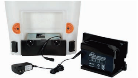
Part No. 7916

The unique battery pack is easily removed without the use of tools for remote charging. The light-weight ergonomically designed tank, full breathable back pad, thick resilient shoulder pads, and waist belt make the ProPack™ comfortable even with a full load.